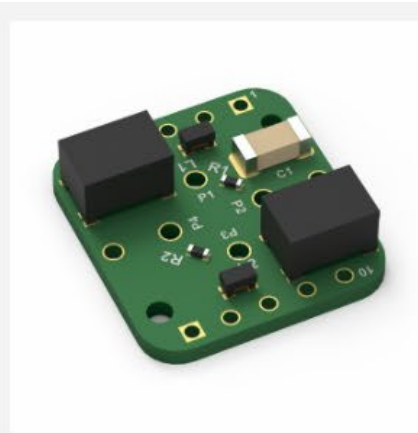
Integrated filter design for 10/100 Base-T Ethernet applications according to IEEE 802.3u