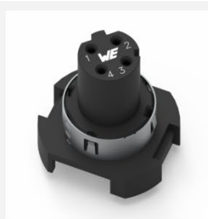
D-coded M12 (IEC61076-2-101) made of high-performance plastic (LCP) for best dimensional stability and temperature stability during reflow